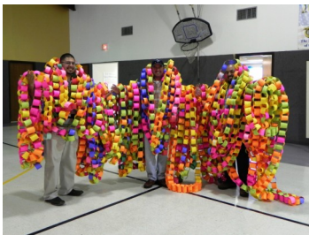
Chain Links from 2010-2011 Representing Random Acts of Kindness

( www.rachelschallenge.org ) Last year our students had over 3000 chain links of random acts of kindness. We believe in building students with good character. Our students have proven that random acts of kindness can exist in our world.